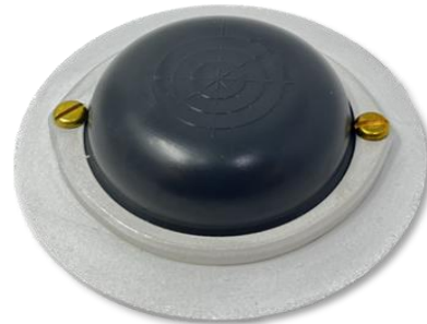
SSL889XF-2 (Mounting Ring) Ground plane not provided