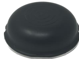
SSL889XF-3 (Adhesive tape)